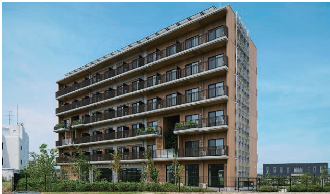
Exterior of “Midorino no Niwa”

construction costs and time while streamlining design and construction work. A press tour was held on June 5. It was attended by 22 members of the press from 16 media outlets, including major news agencies and TV broadcasters. The participants were given an overview of the property and taken on a tour of the facilities, and a Q&A session was held. In the future, this property will be promoted as a model case of medium- to large-scale mass timber multi-family housing, contributing to the realization of a decarbonized society.