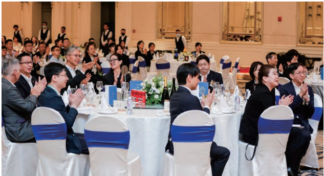
At the ceremony (held at The Castle Hotel, Dalian, China)