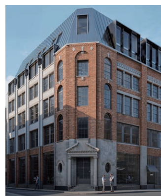
Golden Lane Project, office development involving timber extension and renovation