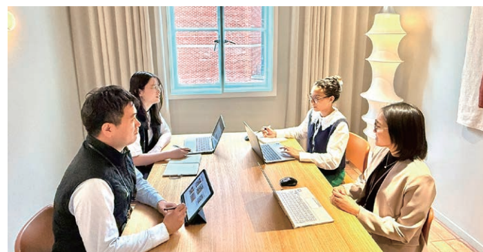
Meeting with members

Head Office: London, UK Established: 2022 Business Activities: Real Estate Development Business Timber and Building Material Business Number of Employees: 7