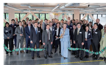
Ribbon cutting at the completion ceremony