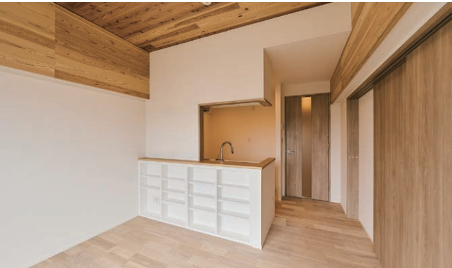
Interior of a home