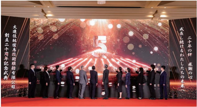
The image lit up when the attendees placed their hands on the screen

“Midorino no Niwa,” located in Tsukuba City of Ibaraki Prefecture, has been completed. This six-story horizontal hybrid structure comprising a reinforced concrete (RC) structure in the center and mass timber structures on both sides, is a company housing project built for Sumitomo Forestry employees. The building incorporates development techniques and materials such as composite beam construction method, Kigurumi CT, and metal joint fittings for hybrid structures. By leveraging techniques and knowhow for medium- to large-scale mass timber constructions, we have successfully reduced