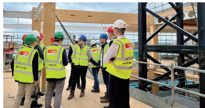
Conducting inspections at a construction site