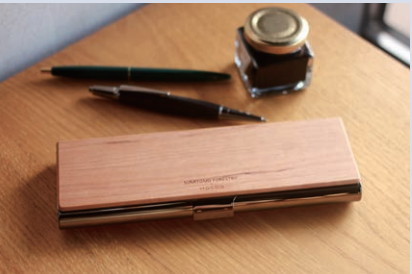
Pen case made from offcuts of flooring materials