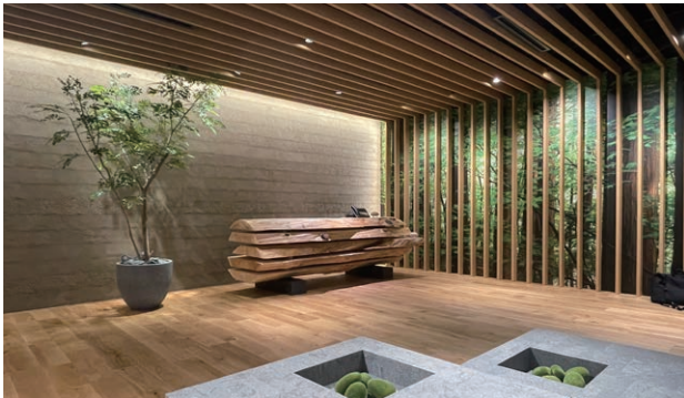
A new office, designed in-house

Head office: Chiyoda-ku, Tokyo Established: 1988 Number of employees: 2,376