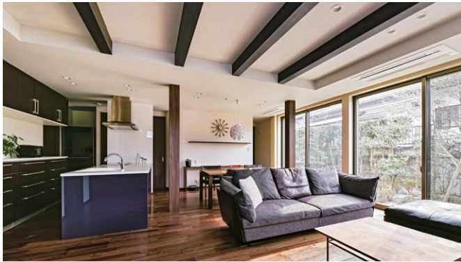
Sumitomo Forestry homes