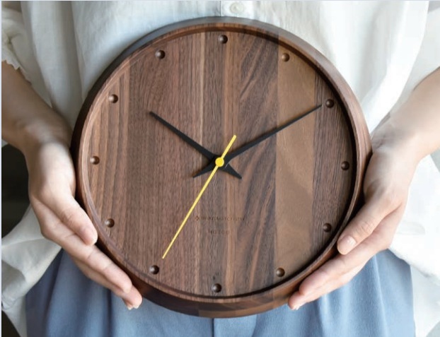
Wall clock (solid walnut timber)

The Timber and Building Materials Division and PT. Sinar Rimba Pasifik (hereafter, “SRP”), which manufactures and sells wooden interior materials in Indonesia, have partnered with “Hacoa,” a brand specializing in lifestyle products, to produce wooden wall clocks. These clocks are made from offcuts of solid pieces of flooring material produced by SRP for use in Sumitomo Forestry’s custom-built houses in Japan. Since January 2024, we have been presenting them as gifts upon the delivery of Sumitomo Forestry’s custom-built homes to customers, to commemorate the completion of their new homes. A distinctive design element of these clocks is the preservation of the knots and color gradation, allowing the owner to enjoy the natural features of the wood. In the production process, particular attention has been given to the beauty of the curved lines, and both machine and manual work have been combined effectively to preserve the warmth of the wood when it is touched by a hand. This marks the second partnership between SRP and Hacoa, the first being the production of pen cases using offcuts from flooring materials in 2020.