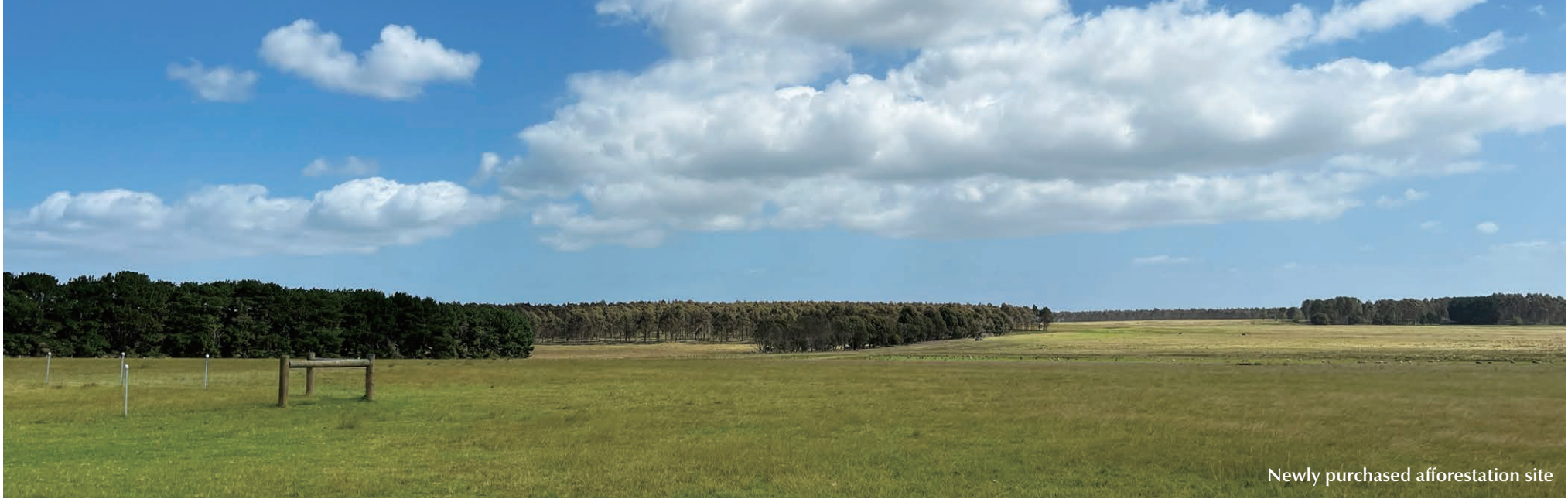
Newly purchased afforestation site

→ Read the press release: https://sfc.jp/english/news/pdf/20240229_01.pdf