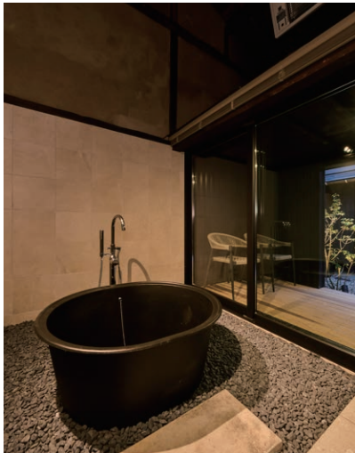
Semi open-air bath with a garden view

enabling carbon fixation through renovations that make use of wood. Furthermore, by leveraging the shear wall/seismic resistant technologies developed jointly with Sumitomo Forestry, we regenerate homes to suit the lifestyles of our customers, and at the same time, provide added value that is unique to Sumitomo Forestry Home Tech and pass it on to the future.