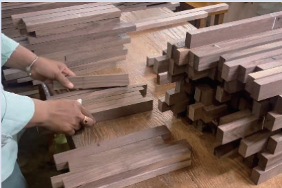
Offcuts generated from cutting flooring materials