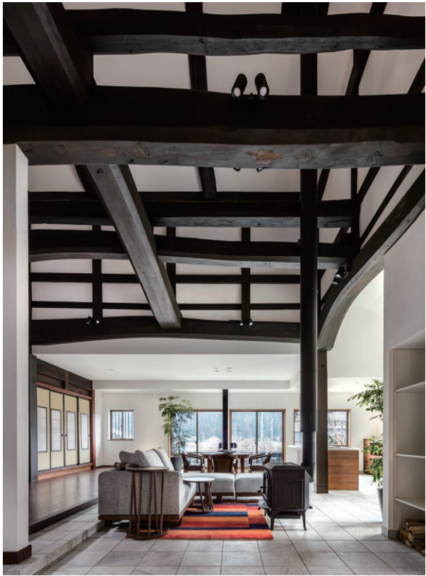
Traditional Japanese-style houses