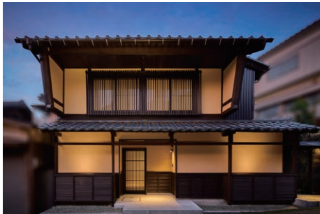
Renovation of a former Japanese confectionery shop

Auberge Homachi Mikuniminato, a hotel converted from townhouses, opened in January 2024. The Mikuni Minato area, where the hotel is located, prospered from the Edo to Meiji eras (around 1600–1900) and is rich in historical and cultural tourism resources. Machiya , which are traditional Japanese townhouses, have been renovated and repurposed as hotel rooms. In addition to improving their quake resistance, the appeal of the existing buildings has also been enhanced.